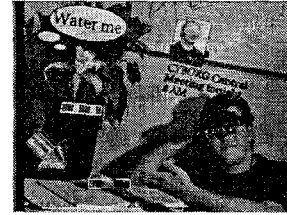
Figure 2: Multiple graphical overlays aligned through visual tag tracking. Such techniques can provide a dynamic, physically-realized extension to the World Wide Web.

Note that limiting message ID's to one byte allows only 256 different states. However, the combination of the Locust's unique position ID, the annotation byte, a user's unique (PGP signature) ID, and some sensing on the wearable computer allows for considerable functionality. As shown in Figure 2, text, video, or