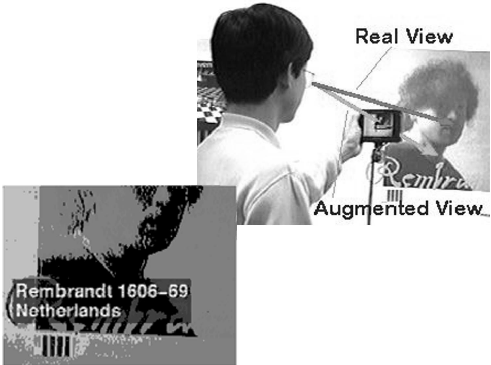
Fig. 1. In Rekimoto and Naga's [1995] NaviCam system, a handheld device recognizes tagged objects and then overlays context-sensitive information.

Although numerous systems that leverage a person's identity and/or location have been demonstrated, these systems are still difficult to implement. Salber et al. [1999] created a "context toolkit" that simplifies designing, implementing, and evolving context-aware applications. This work emphasizes the strict separation of context sensing and storage from application-specific reaction to contextual information, and this separation facilitates the construction of context-aware applications. Mynatt et al. [1998] point to the common design challenge of creating a believable experience with context-aware interfaces noting that the responsiveness of the interface is key to the person associating additional displays with their movements in the physical world.