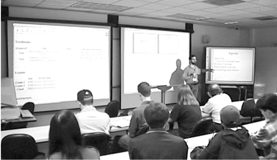
Fig. 4. In the Classroom 2000 project, we have had the ability to learn from long-term actual use in the Georgia Tech educational environment.

ence as possible to facilitate later review by both students and teachers. In many lectures, students have their heads down, furiously writing down what they hear and see as a future reference. While some of this writing activity is useful as a processing cue for the student, we felt that it was desirable from the student and teacher perspective to afford the opportunity for students to lift their heads occasionally and engage in the lecture experience. The capture system was seen as a way to relieve some of the note-taking burden.