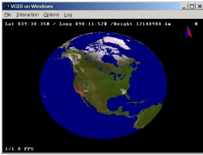
Figure 1: Orbital View from VGIS