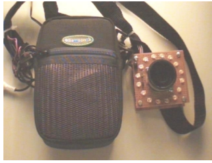
Figure 4: Gesture Pendant

Dragon 8 , a 3D battlefield visualization tool 7 . Our multimodal interface is based on speech and hand gesture, rather than speech and pen stroke in Quickset or speech and raycast strokes as in Dragon. The pen and stroke gestures require reference to a display surface. With a body mounted camera, users interact at a distance from the display.