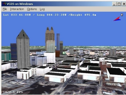
Figure 2: Surface View from VGIS

to understand the qualities and limitations of multimodal speech and gesture interfaces for particular tasks, rather than merely comparing performance with other interfaces.