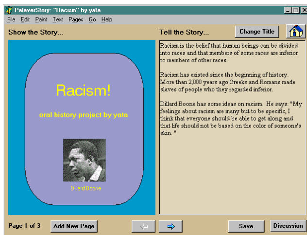
Figure 3: PalaverStory

For example, the Kid Home Screen features a list of discussions, an indication of which discussions the user has contributed to, and their PalaverStories within the community. A listing of other students' PalaverStories is also available, so kids can see the progress others have made – providing a social incentive for kids to create.